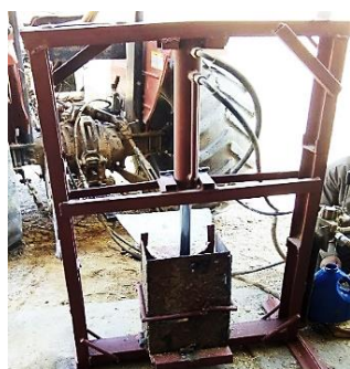
Figure 1 feed block production machine, designed and built by the researcher

The frame of the machine was crafted using iron No. 14 waste material, while a hydraulic jack from an excavator, capable of handling 5 tons of load, was incorporated into the device. This jack was mounted vertically within the frame and connected to the tractor gearbox via high-pressure hoses to supply the necessary oil pumping power (figure 1). A critical aspect of the machine was the design and fabrication of the mold, which underwent numerous iterations before achieving success. Ultimately, the mold was perfected to produce feed blocks measuring 10x30x20 cm and weighing between 4 to 5 kg DM.